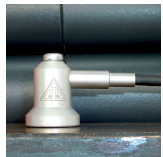
Flat surface with side connection (cable or telescope).

We are happy to adapt probes to suit your individual requirements. Simply send us a short mail to: vertrieb@testo.de .